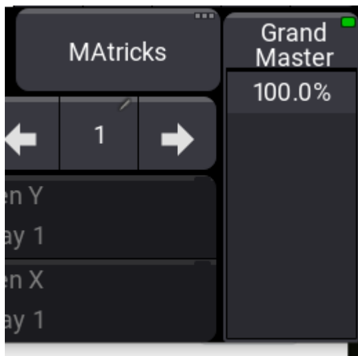
Grand Master in the encoder bar

The Grand Master level can be set by the fader and the Grand Master function can be enabled or disabled by pressing Grand Master .