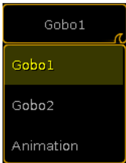
Swiped Gobo Feature

You can tap the text (Gobo1) to toggle thru the possible features. All buttons on the screen with the little "wave" icon in the lower right corner have a swipe function. Try to press/click and hold while you move out of the frame of the button, then you can release the hold. This will open a small list with the possible choices: