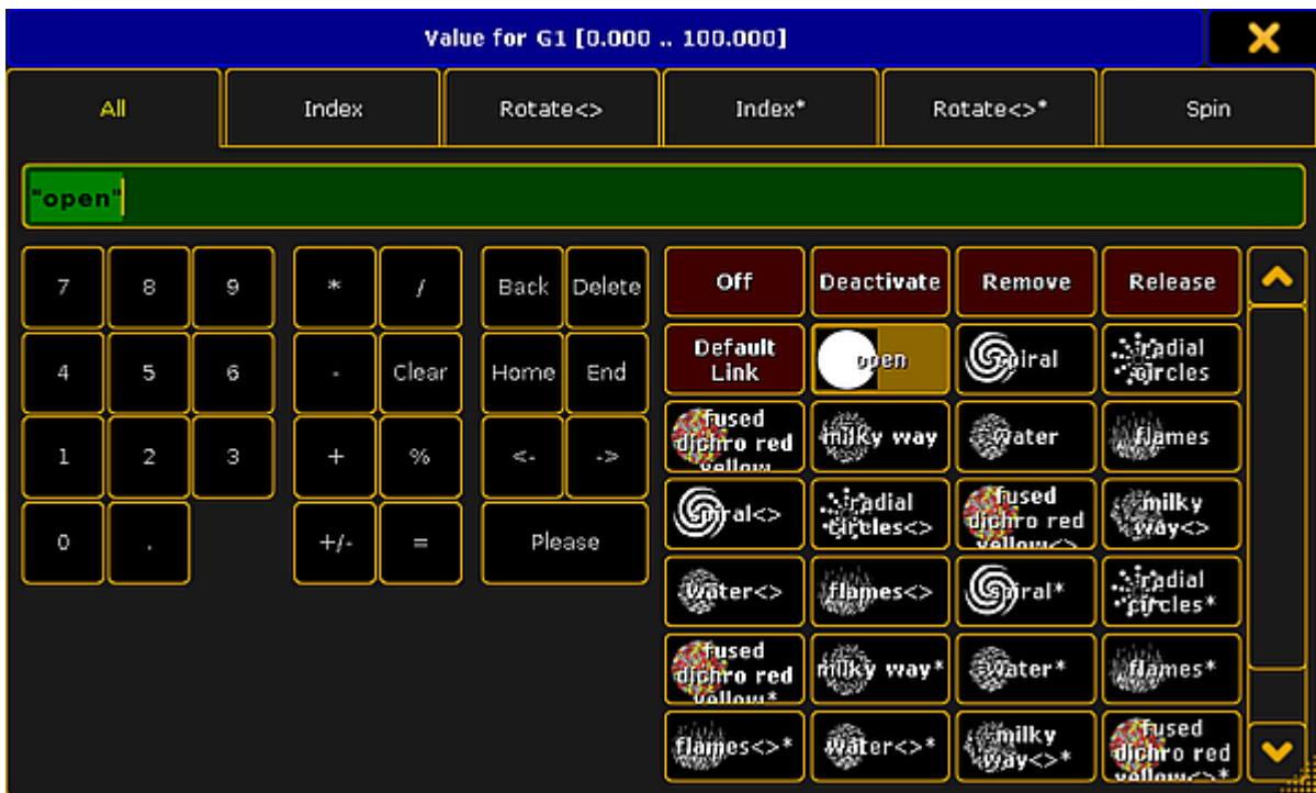
Next to the usual buttons with numbers, there is a lot of buttons that changes according to your selections. When gobo is selected you have easy access to all the different gobos. Try to tap the button called "Water".

Notice how some of the buttons in the Preset Control Bar have a red square and some a gray one. The red one indicates that you have changed values in that preset type. This value will be saved if you press the 'Store' key (do not do it now).