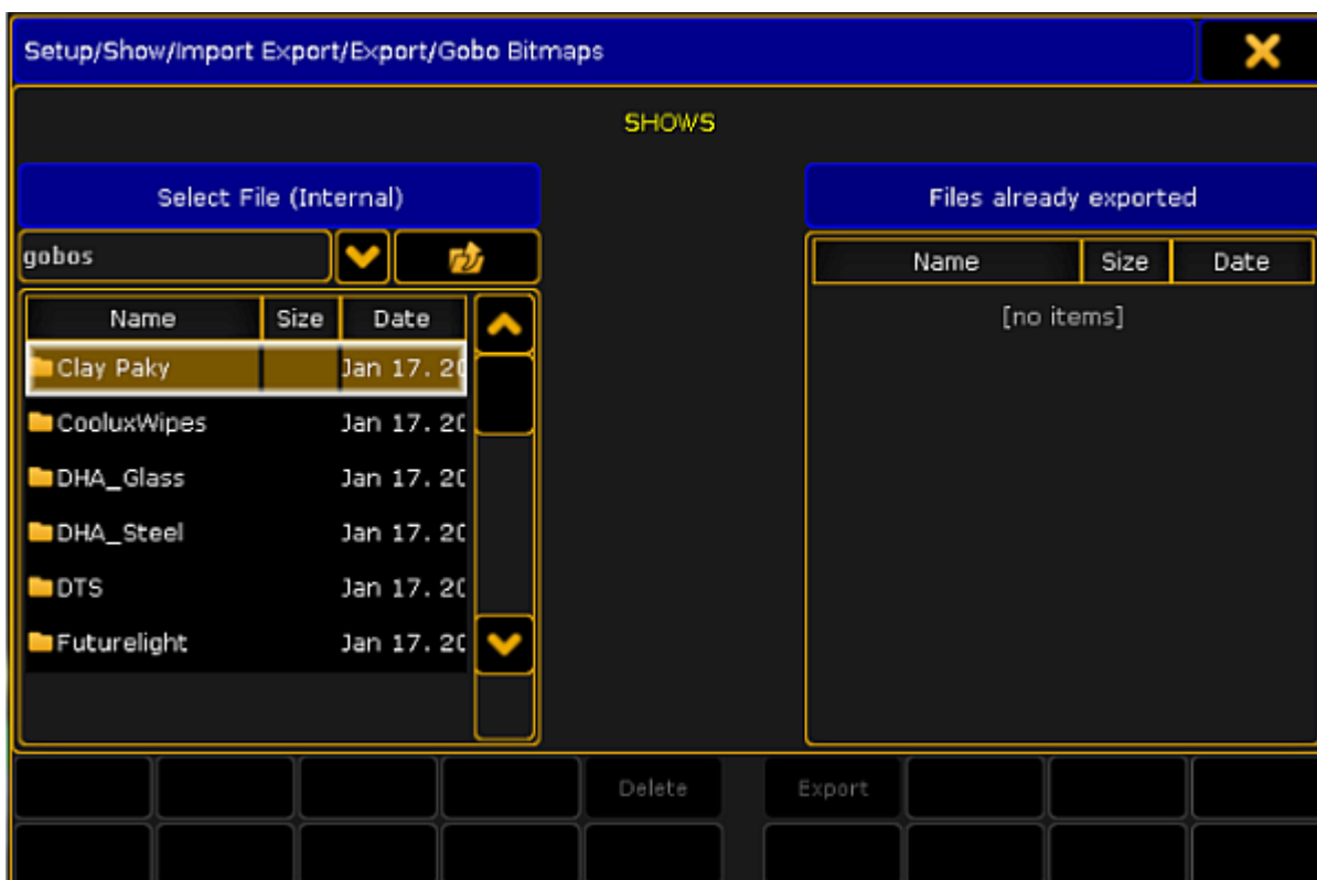
Export gobo bitmap pop-up