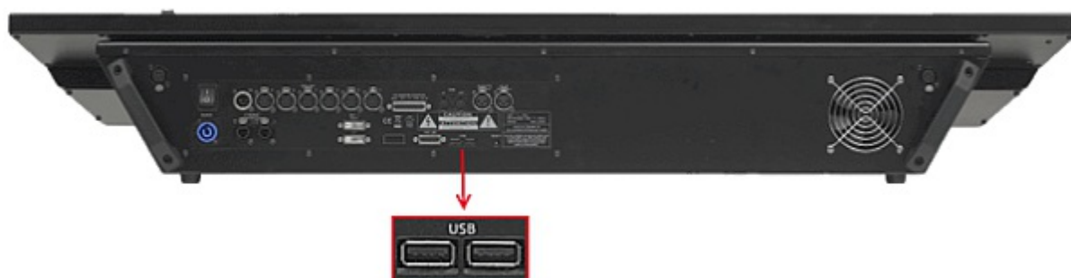
grandMA2 full-size USB connector rear panel