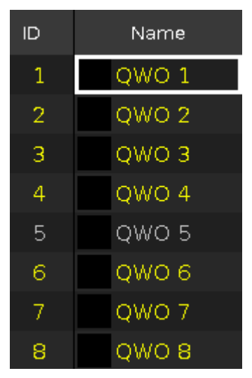
Figure 1: Fixture selection list - one fixture is missing