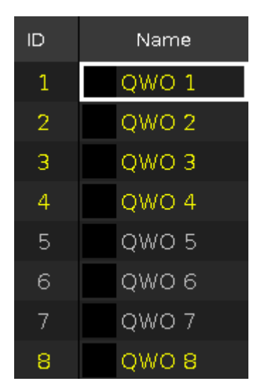
Figure 3: Fixture selection list - fixture 5 thru 7 are missing

• Press + 5 Thru 7 Please on the console.